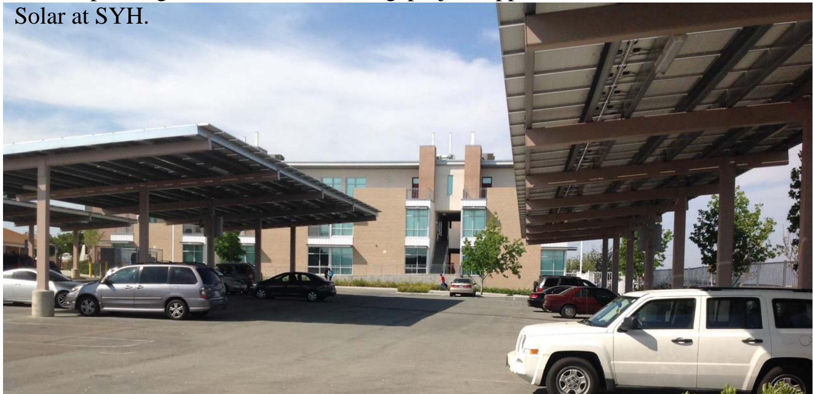
Solar at SYH.

Work is complete at MVH, SUH, OLH, SYH, CPM, ORH, CVM, ELM, MVM, BVM , and HTH. At RDM, the solar canopies are complete, but additional work requested by the Chula Vista Fire Department is still pending. We are still awaiting project approvals from DSA for the work at MOM.