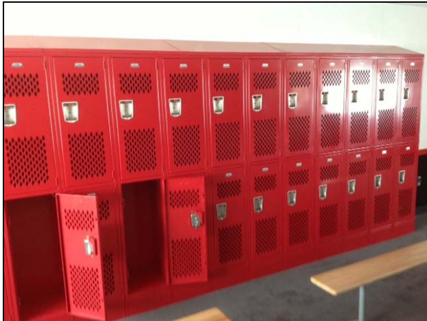
Team Locker Room

CPH Title IX Improvements ( Lord Architecture, Phase I – GEM Industrial, 99%; Phase II design 100% ) – Phase I consists of relocating 4 existing portable classrooms for team rooms and installation of a restroom building and a long ramp for accessibility to the lower campus. Phase I is essentially complete with only a few punchlist items remaining. Phase II consists of new concrete block dugouts for the softball field and additional field improvements. Phase II is out to bid with bids due May 28 th . Construction is scheduled to be complete in Fall 2013.