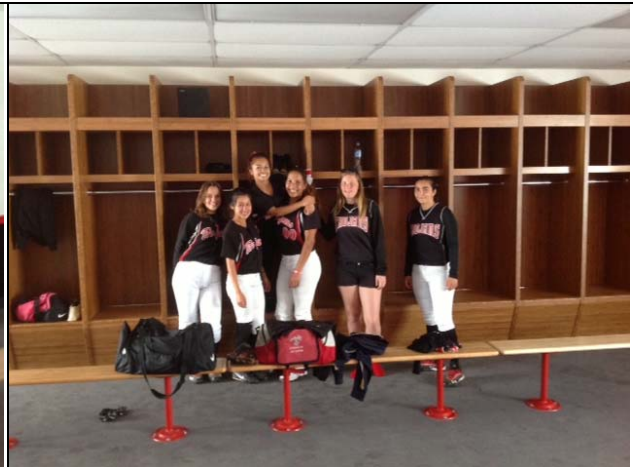
Girls Softball Team Room