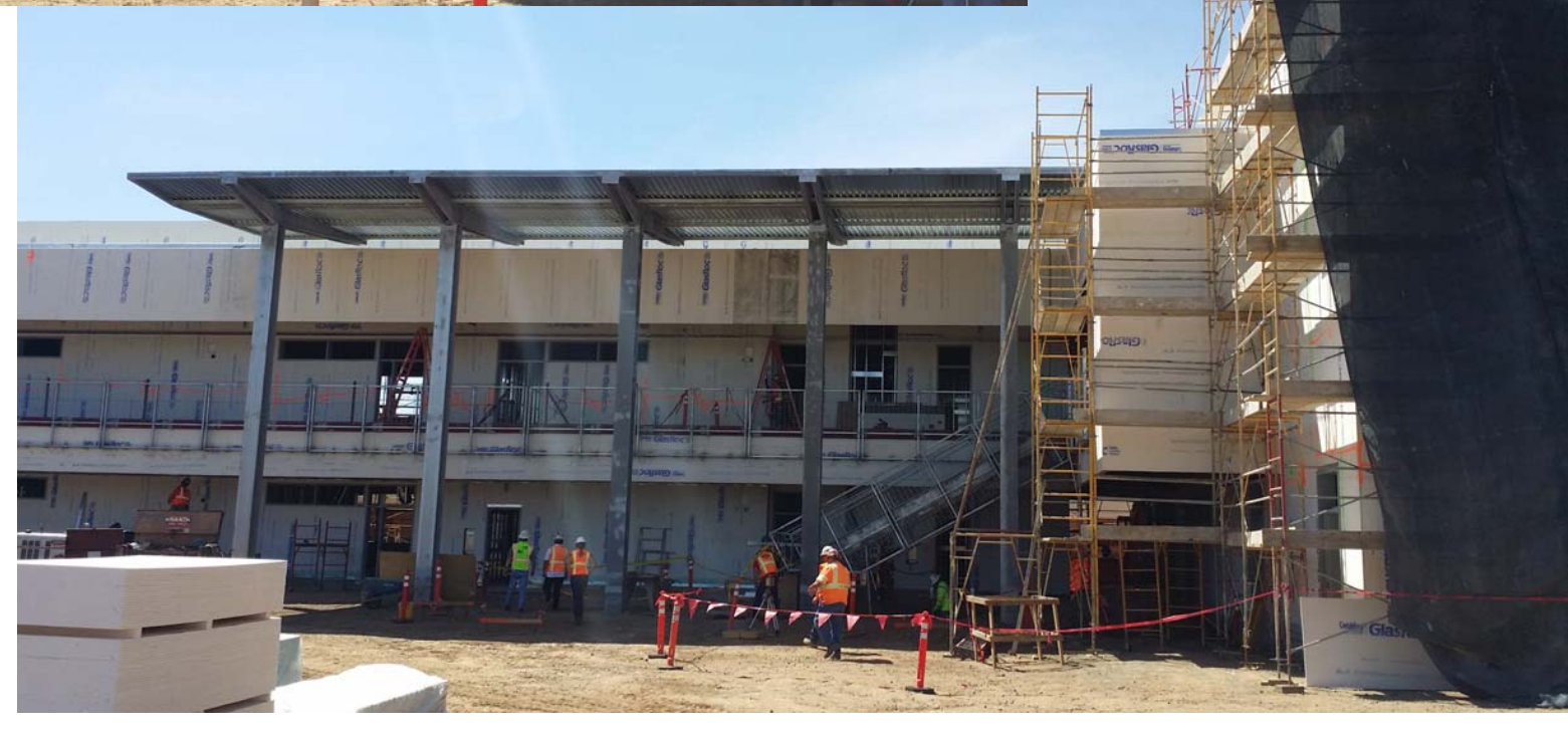
Prop O Project Update – May 14, 2014