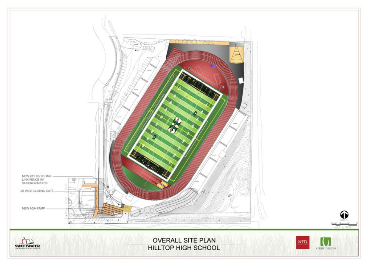
"Sweetwater Union High School District programs and activities shall be free from discrimination based on gender, sex, race, color, religion, ancestry, national origin, ethnic group identification, marital or parental status, physical or mental disability, sexual orientation or the perception of one or more of such characteristics." SUHSD Board Policy 0410.

This project is for the design of an artificial track and field. Construction documents are scheduled to be completed in the Fall 2013. The project was submitted to DSA on December 26th 2013.