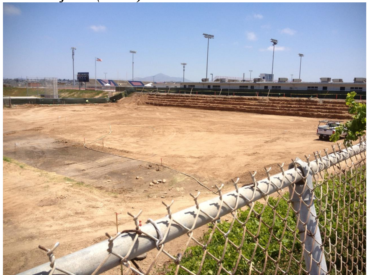
Montgomery Middle School:

MOM Project 1 ( LPA , Balfour Beatty , 88%) — Construction continues: Testing and balancing of HVAC system is nearly complete; landscaping is being installed; building interiors and casework are nearly complete; site paving continues. . Completion scheduled for August 2013 (move in during summer break).