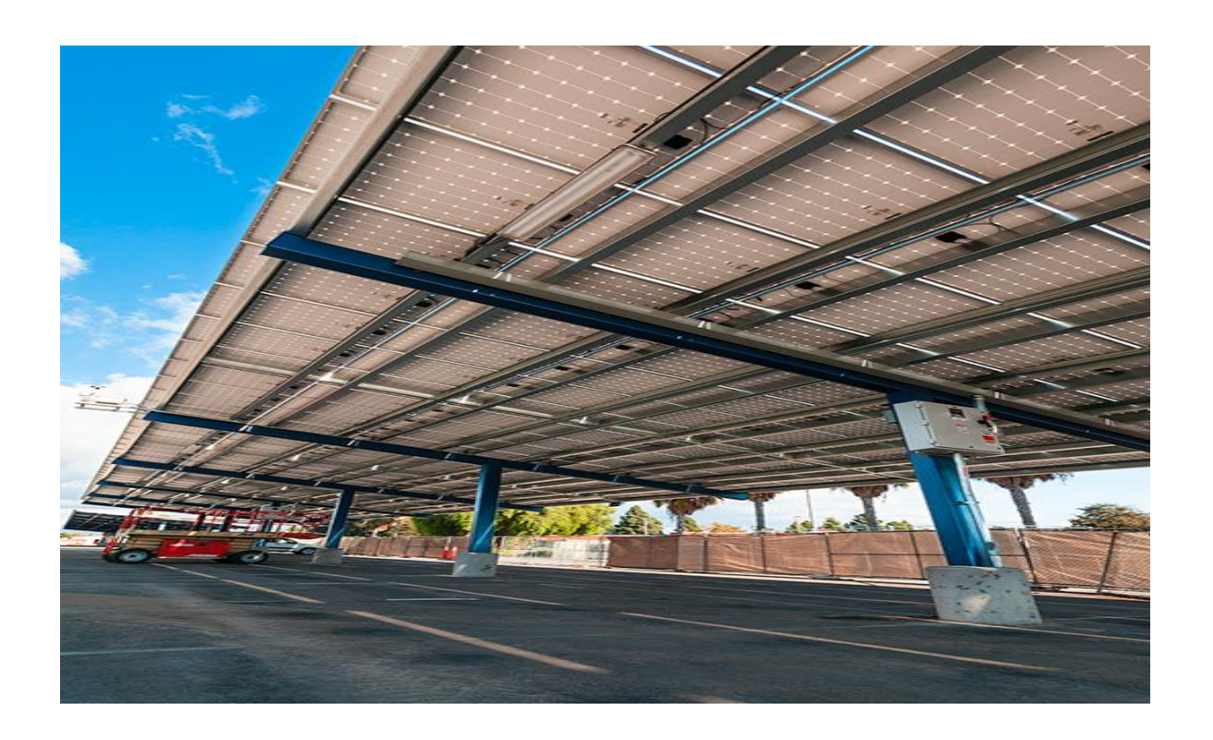
PPA2 (Solar at 17 sites) (various, tbd, 10%) –Mobilization has taken place at: ORH, OLH, SUH, MVH, SYH, and CPM. Steel is being delivered to all six sites and steel columns have been erected at MVH, ORH and SYH.

PPA (Solar at 10 sites) (various, Lend Lease, 100%) – This morning SUHSD received an award for being the SGD&E K-12 Energy Showcase Champion for 2012.